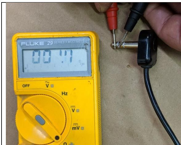
Figure 1 Switch not pressed.